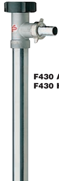
F430 AL F430 HC