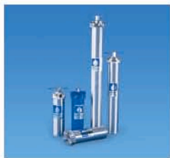
Single Cartridge Housings

JH Filters manufactures a full line of filter housings. From our rugged single element housings to our heavy-duty multi-rounds and bag housings, we have the right filter for your requirement. JH Filters is the perfect choice for your problem solutions.