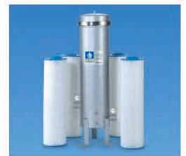
Jumbo Cartridge Housings