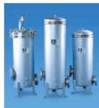
High Flow Multi Cartridge Housings