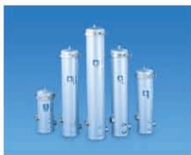
Multi Cartridge Housings