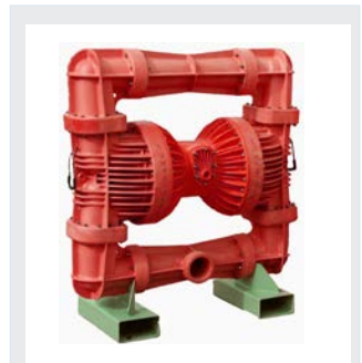
Red Series FRASplas Body- Fire Retardant Antistatic Construction - Safe for Explosive Environments- ATEX M1 Rating