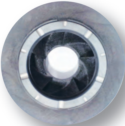
Optimized Suction Eye For Low NPSHr.

The Ansimag series of pumps from Sundyne has set the standard for ASME (ANSI) lined sealless magnetic drive process pumps. Conforming to ASME (ANSI) B73.3 and incorporating many advanced engineering features, the rugged Ansimag K provides unmatched performance and reliability while reducing your total cost of ownership. With flows up to 600 GPM (153 m 3 /hr) and TDH up to 325 ft. (95m) the K is ideal for most corrosive or acidic applications in the Chemical, Specialty Chemical, and Steel industries.