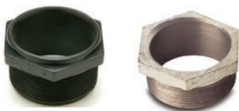
Polypropylene Galvanized Steel

Keeps pump snug in container bung and limits the escape of fumes.