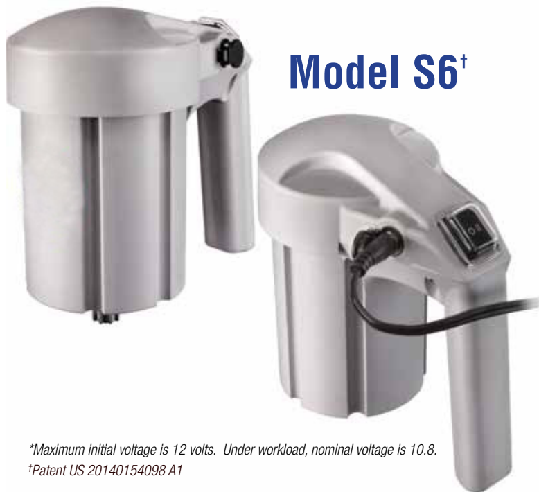
Model S6 +